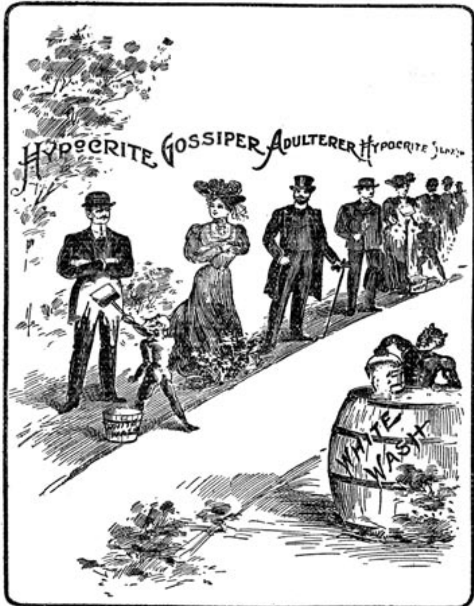
THERE ARE MANY PERSONS WHOSE BLACK CHARACTERS ARE COVERED BY THE DEVIL'S WHITEWASH.