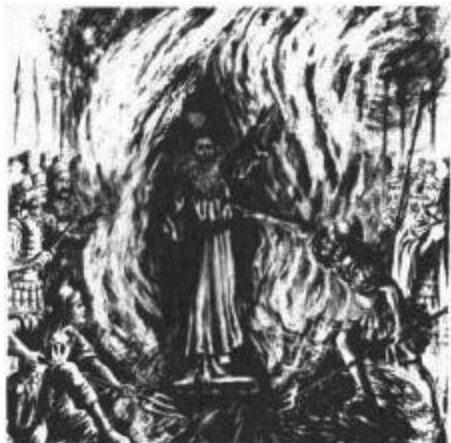
Polycarp not being burned by the flames of the fire is thrust through with a spear.

The proconsul, or chief officer of the government, then tried very hard to persuade Polycarp to renounce Christianity and swear by the gods of Rome. Polycarp listened attentively to all he had to say, and then gave this as his noble answer: "Eighty and six years I have served my blessed Saviour. He has done nothing but bless me all the time; then how can I forsake him now?" Then he was led forth to execution. The officers had determined that he should be burned